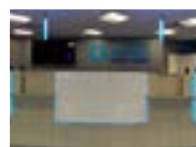
Personal Service with a Teller